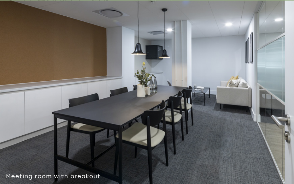
Meeting room with breakout