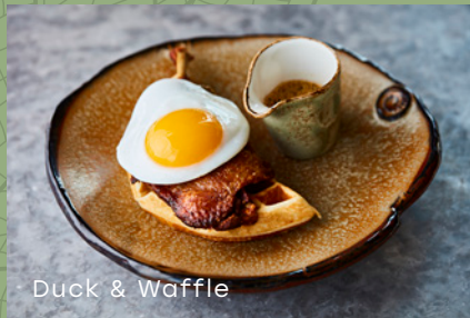
Duck & Waffle

The building is surrounded by a vibrant mix of cafés, bars, restaurants, retail, hotels and gyms, offering both convenience and lifestyle appeal. The building is superbly connected, sitting equidistant from three major transport hubs: Bank, Moorgate, and Liverpool Street stations.