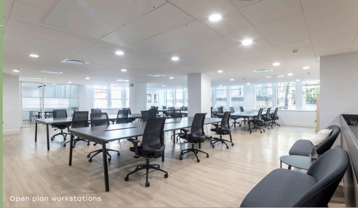
Open plan workstations